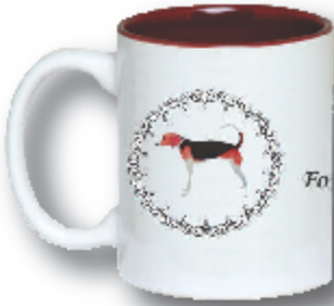
Full Color Mugs Two-Tone, Burgundy/White 11 oz.