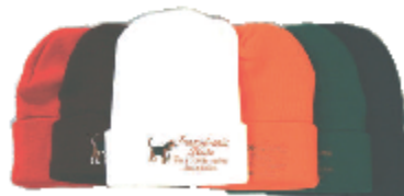
Beanies w/ Cuff