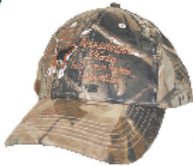
Camo Caps $15.00